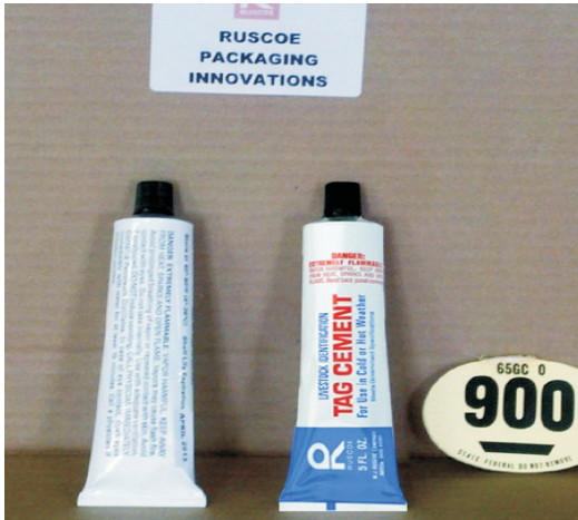
(1) 5 oz. tube.