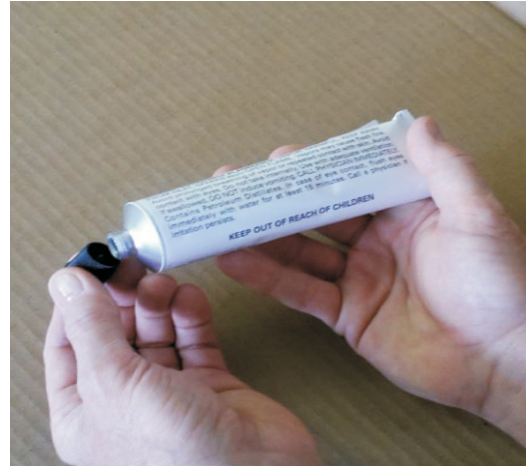
(2) Unscrew cap and have tags handy.