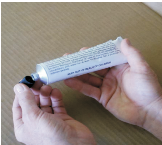
(3) Using the reverse side of the cap, puncture the foil seal in tip of tube.