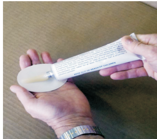
(4) Apply a bead across the middle of the back of the tag (approx. 1/4" diameter).